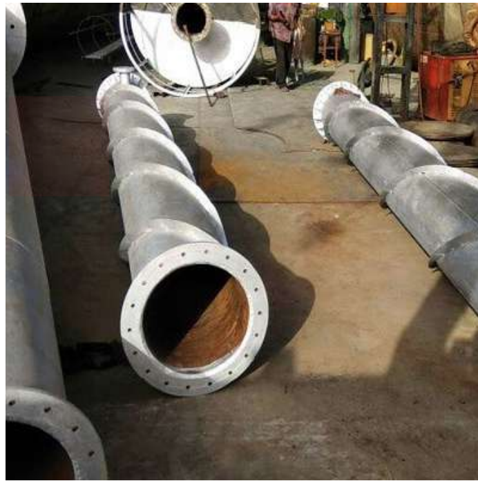
Chimney Fabricated for SAFCOL Timbadola Plant