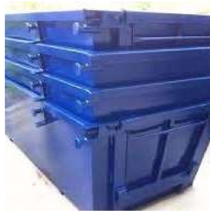
Skip bin repairs for ABInBev (SAB) Polokwane Plant