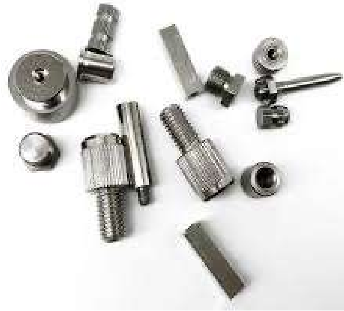
Engineering jobs completed