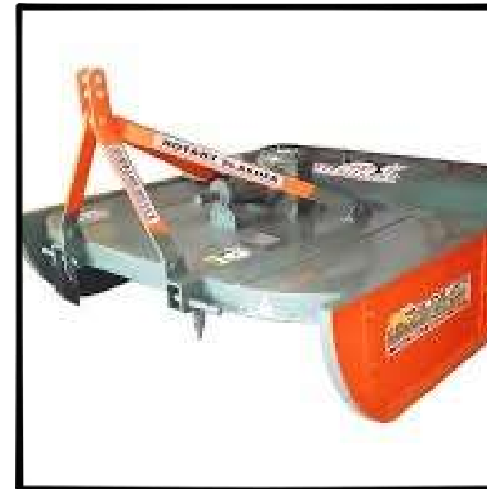
Slasher repairs for Polokwane Municipality